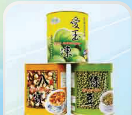
LARGE CAN BEEN (CAN EXAMPLE)