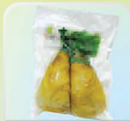
BAMBOO SHOOTS (WRAP EXAMPLE)