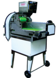
LEAF AND STEM CUTTING MACHINE