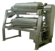
PULP FILTER (DOUBLE LAYER)