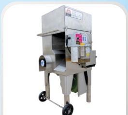
SWEET CORN KERNEL REMOVING MACHINE