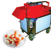
WHEEL TYPE VEGETABLE CUTTING MACHINE