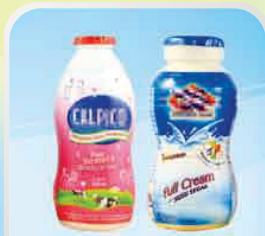
MILK PRODUCT (BOTTLED EXAMPLE)