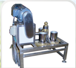
PINEAPPLE SLICING MACHINE