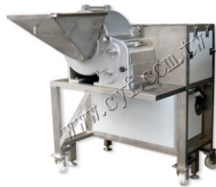
LARGE SCALE CABBAGE DICING MACHINE