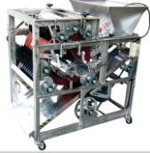
PEANUT STRIPPING MACHINE