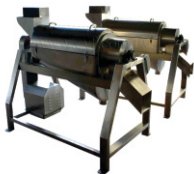
PULP FILTER (SINGLE LAYER)