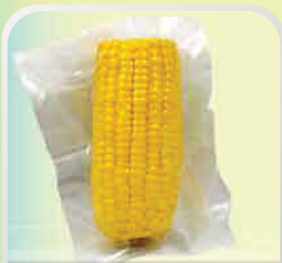
CORN (WRAP EXAMPLE)