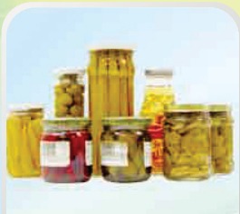
AGRICULTURAL PRODUCTS (BOTTLED EXAMPLE)