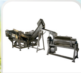
LITCHI HUSKING AND SEED SEPARATOR