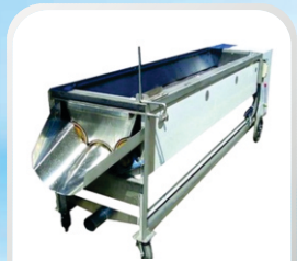
HORIZONTAL FIVE AXIS WASHING MACHINE