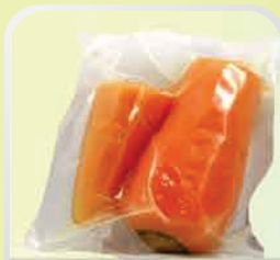
CARROT (WRAP EXAMPLE)