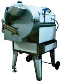
VEGETABLE CUTTING MACHINE