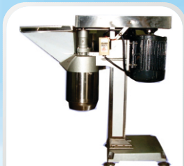
LARGE SCALE CRUSHER